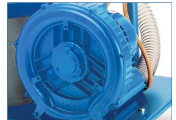
High-power side channel compressor, almost-wear-free