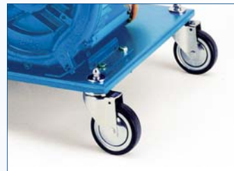
Base plate with wheel, steerable