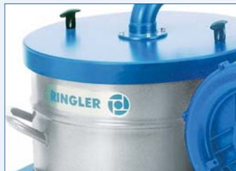
Steel collection tank, volume 50 litres