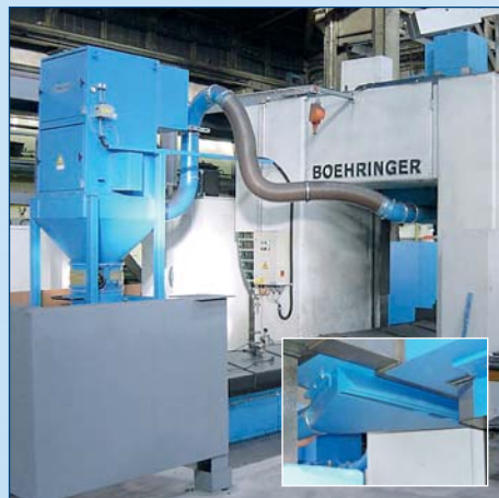
RE 301 with spindle extraction nozzle on a Boehringer portal milling centre