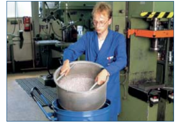
40 litre filter basket (standard) to separate chips and coolants