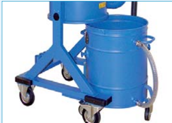
100l run-out collection tank