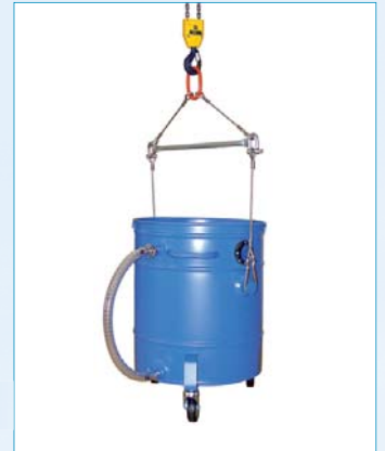
Optional: Crane transport by means of crane bow