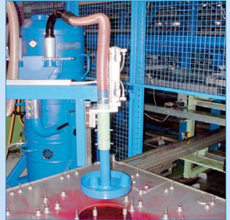
RI 321 D3: used here for the automatic extraction of oil on pallet deck spacers in the automotive industry