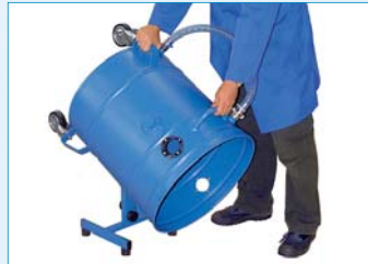
Optional: Emptying by tipping with frame as emptying aid