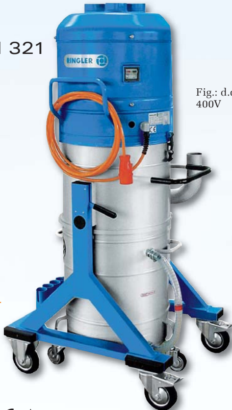
Fig.: d.c. model 400V