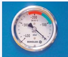
Optical filter monitoring