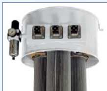
Jetfilter cleaning with counterflow principle