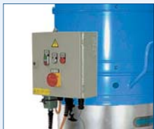
Control cabinet for motor, valves and level sensor